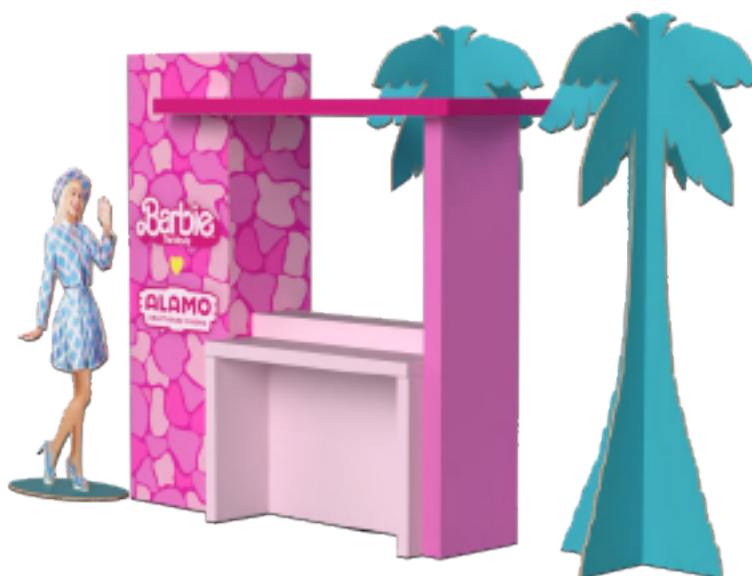
Rendering for 3D display