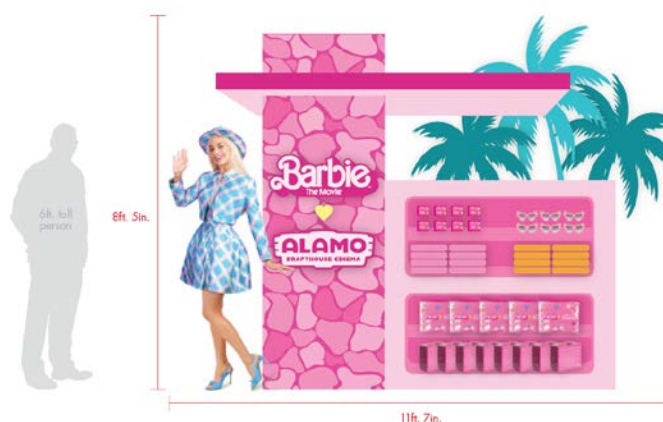
Original client concept

Along with the large merchandise setup, we also produced a more compact version of the display to fit the smaller footprint locations, along with 1,000 hologram foil stickers for promotions.